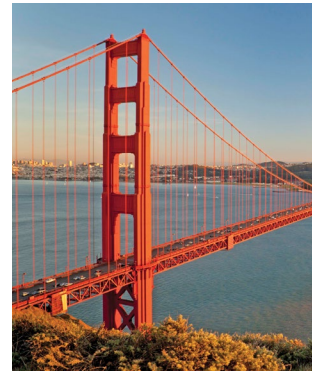
The Golden Gate Bridge opened in 1937. Construction of the bridge was bonded by The Hartford.