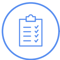
The compliance office

It’s critical that we all take responsibility for ensuring that the standards set forth in this Code go beyond mere words and translate into action. This means that if a violation comes to your attention, you’re required to take action, because turning a blind eye or ignoring the situation is a way of contributing to the unethical situation. Therefore, each teammate has the responsibility to report unethical behavior to any or all of the following: