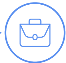
The legal department