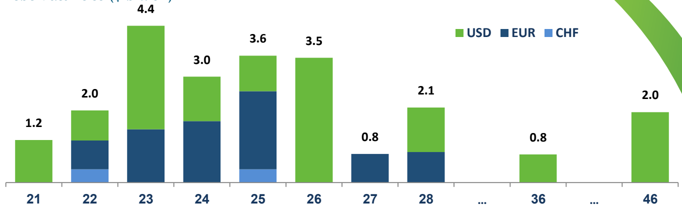
Debt Maturities ($ billion)